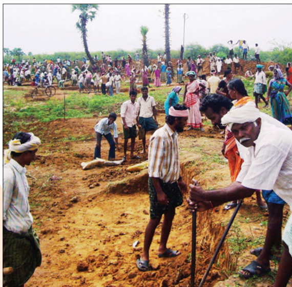
Suvarna Gramodaya Scheme”